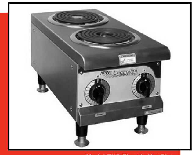
Model EHP Electric Hot Plate