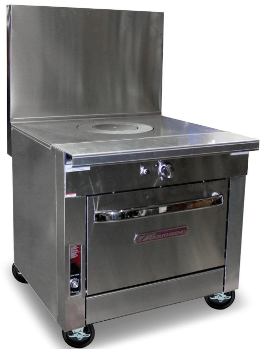
Model P36A-GRAD with optional 24" flue riser