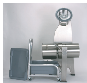
FOOD CART SHOWN WITH VCM