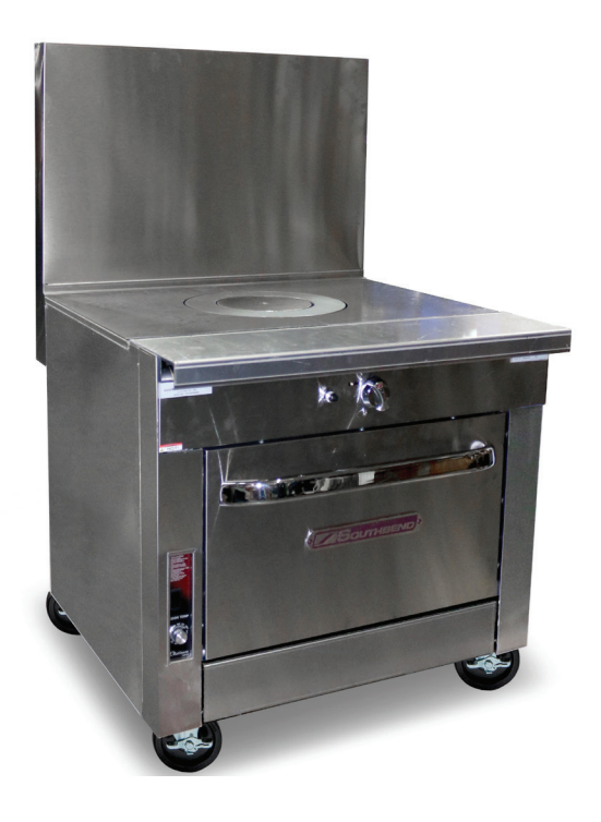
Model P36A-GRAD with optional 24" flue riser