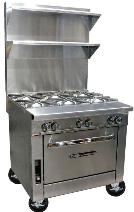
Model P36A-BBB shown with optional 36" flue riser and casters