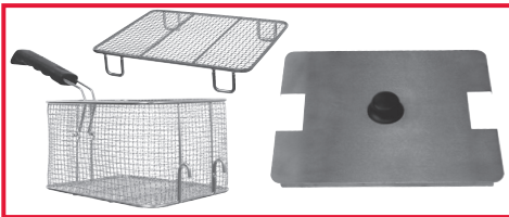
Included Accessories: Fry Basket Assembly with Cover • Well Cover