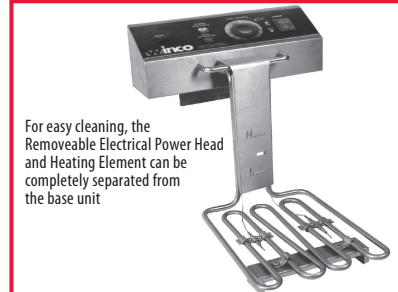
For easy cleaning, the Removable Electrical Power Head and Heating Element can be completely separated from the base unit.