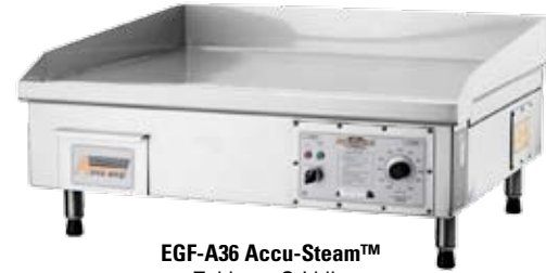
EGF-A36 Accu-Steam™ Tabletop Griddle