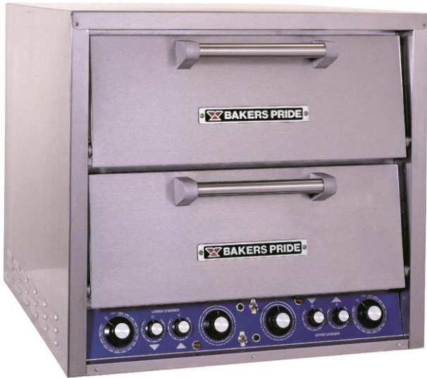
Model DP-2 with optional top & bottom heat controls