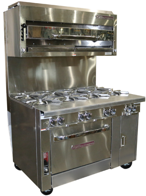
Model P48A-BBBB shown with optional 48" Salamander and casters