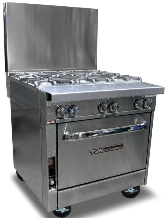
Model P32A-BBB shown with optional 24" flue riser and casters