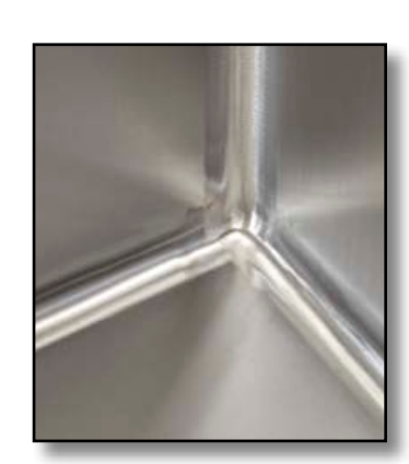
"All-Coved" corner construction