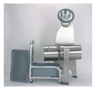
FOOD CART SHOWN WITH VCM