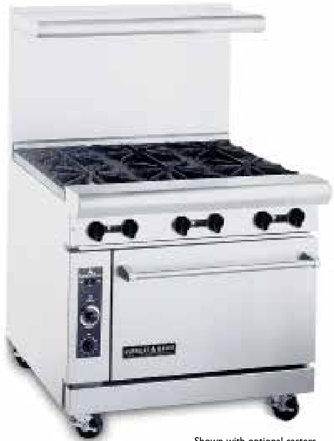
Shown with optional casters & Convection Oven